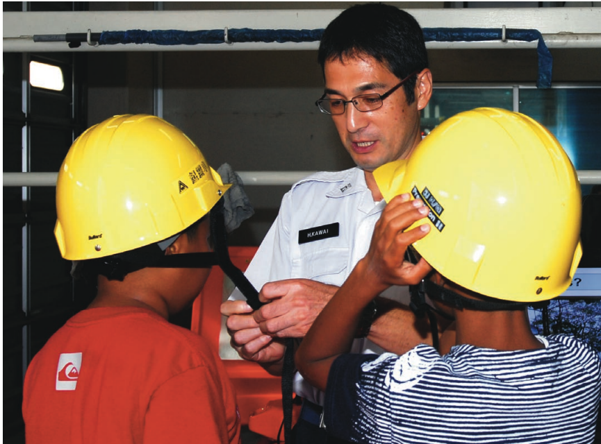
Photo: Students put on safety helmets before entering an earthquake simulator in Yokosuka, Japan, October 2008. Taken by Kari R. Bergman. Released into the public domain by the U.S. Navy.