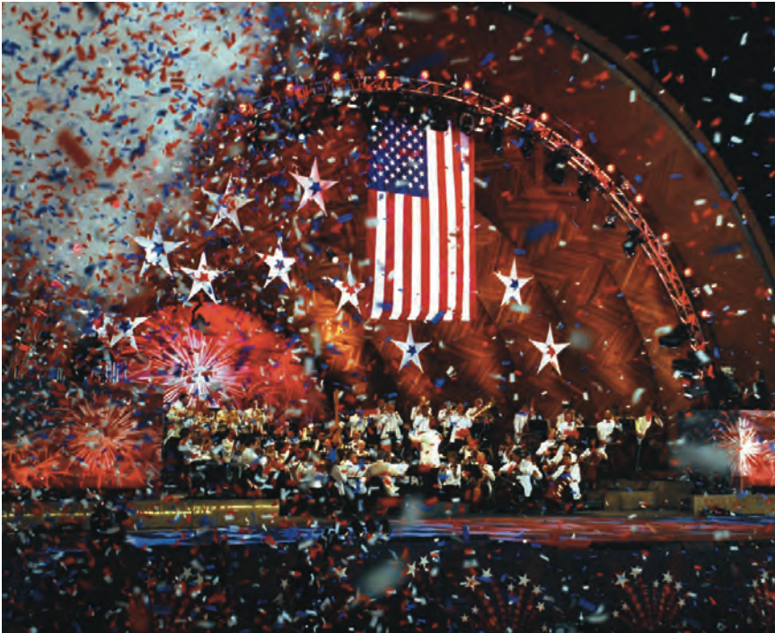
Photo: Confetti rains down at a July 4th celebration featuring the Boston Pops Orchestra in Boston, Massachusetts, July 2008.