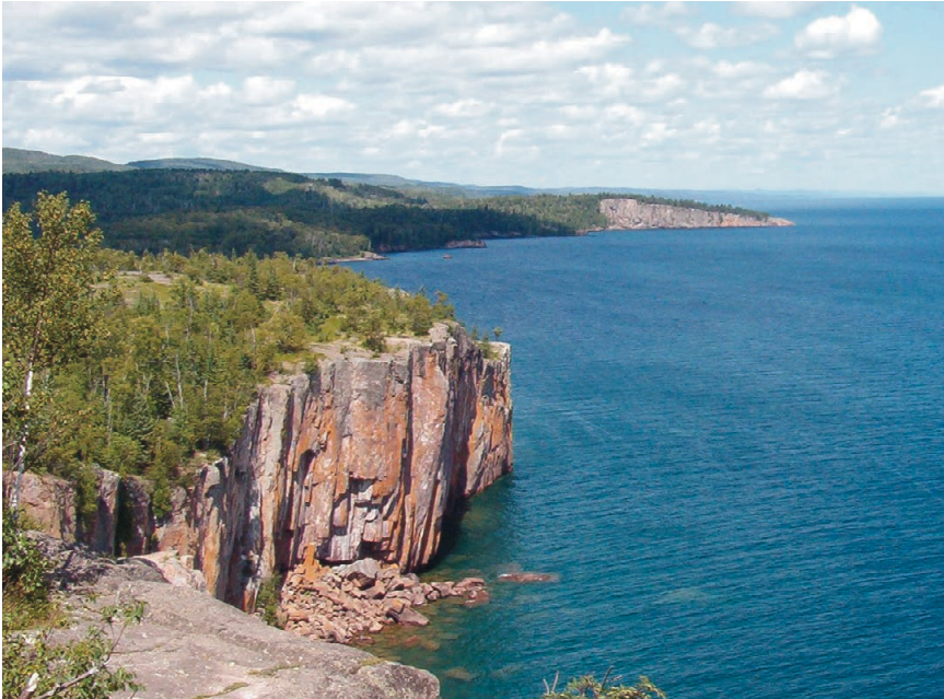
Photo: View from Palisade Head in Minnesota's Tettegouche State Park on the North Shore of Lake Superior, August 2008.