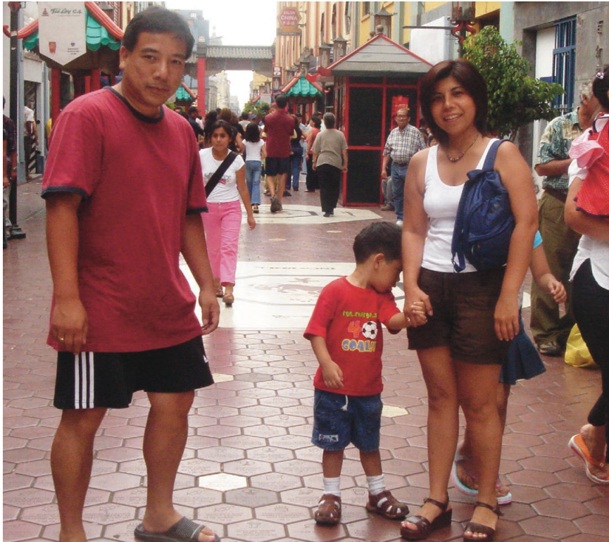
Photo: A family poses in Lima, Peru's Chinatown, January 2006.